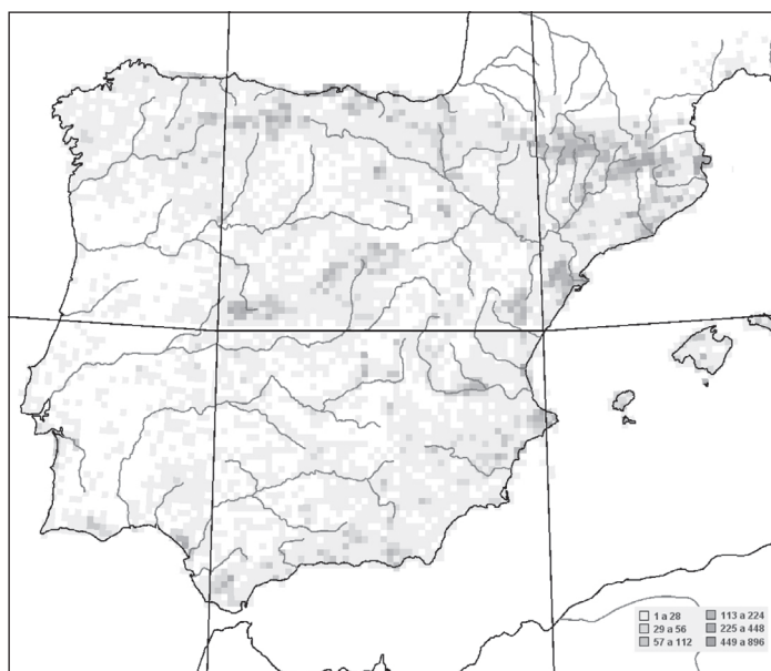
Figure 2. Geographic distribution of the relevés computerized in SIVIM. Color intensity indicates the number of relevés in each cell of the UTM 10 \times 10 km grid.

project goals by the end of 2012 is to reach 125,000 Ibero-Macaronesian vegetation relevés which would represent two thirds of the lower estimation of accessible data in the territory covered by the database. During its first year of operation, the SIVIM web has received 22,000 visits for consulting or requesting data.